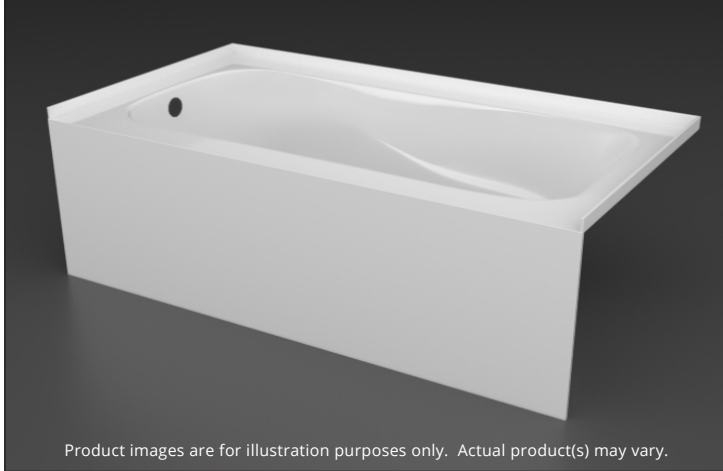
Product images are for illustration purposes only. Actual product(s) may vary.